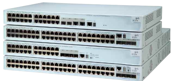
from top: 3Com Switch 4500 26-Port, Switch 4500 50-Port, Switch 4500 PWR 26-Port, Switch 4500 PWR 50-Port

Two Switch 4500 models provide Power over Ethernet (PoE). PoE provides electrical power and data connectivity over a single Ethernet cable—resulting in significant cost savings when deploying devices like IP phones, wireless access points and IP security cameras.